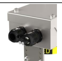
Fig. 9: -2MA