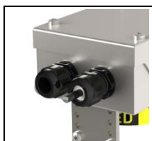
Fig. 8: -MA

Depending on the model, the limit switch boxes of EUROTEC provide the possibility to connect one or two solenoid coils inside the housing. The suitable switch boxes for one coil are marked with an additional '-MA' in their part number. This version has a cable with a length of 500mm that is connected to the terminal block inside the housing and lead outside the housing through a cable gland. The leads of this cable have to be wired to the plug connector of the solenoid coil. Please consider the coil manufacturer's operation manual and the circuit diagram on or inside the limit switch box cover or on the according technical data sheet. The same applies to the connection of two solenoid coils. This version is marked with an additional '-2MA' in it's part number and provides two cables with a length of 500mm each. With the models "-2KV" and "-2NPT1/2" the solenoid valve connection is optional on poles 7-9.