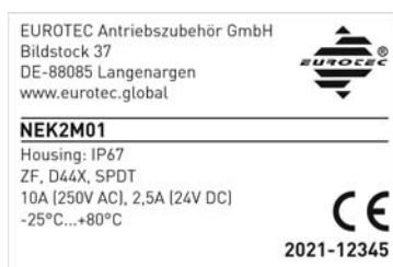
Fig. 1: Product label

The product label on the housing is shown in figure 1. Each switch type has its own label. The serial number is to be found below the CE symbol. It contains the year of manufacture and the referring production number.