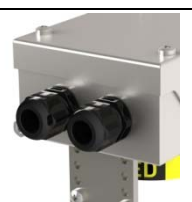
Fig. 10: -2KV