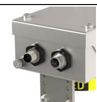
Fig. 12: -M12-MA12