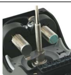
Fig. 6: Fixation of cam 1