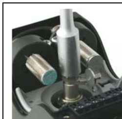
Fig. 5: Loosen nut screw