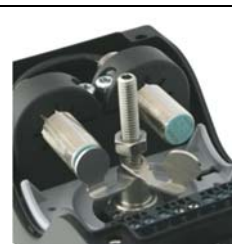
Fig. 7: Fixation of cam 2