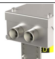
Fig. 11: -2NPT1/2