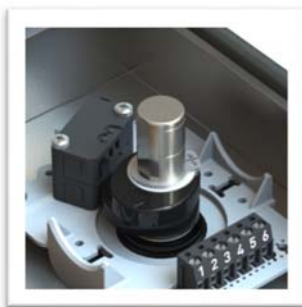
Abb. 2: Standard terminal block